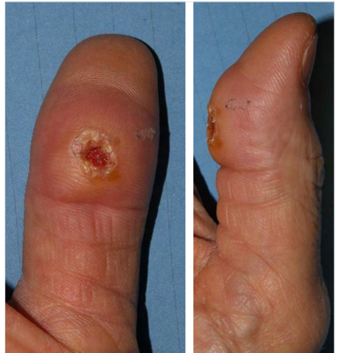
Figure 1. Clinical aspect of the neof ormation presenting the nodule with hyperkeratotic and ulcerative central lesion at the thumb.

A 54-year-old caucasian male, with no relevant medical history and no referred trauma, presented to our Hand Surgery Center with a lesion that had appeared 4 months earlier on the pulp of the thumb of his right-dominant hand. The tumefaction extended from the pulp to the volar aspect of the flexion crease of the interphalangeal joint (IPJ) of the thumb, showing a well-defined nodule with a hyperkeratotic and almost ulcerative central lesion (Fig. 1). The lesion was referred as a slow-growing mass, was solid and painfulness, with no erythematous or swelling, and movable on the underlying plane. The finger was neurovascularly intact. The range of motion at the IPJ was reduced in flexion (from -15° of hyperextension to 65°) due to the pain induced by the ulceration and the mechanical limitation of the mass at the crease. Ultrasound documented the well-circumscribed solid mass and radiographic examination showed no features correlated with the lesion.